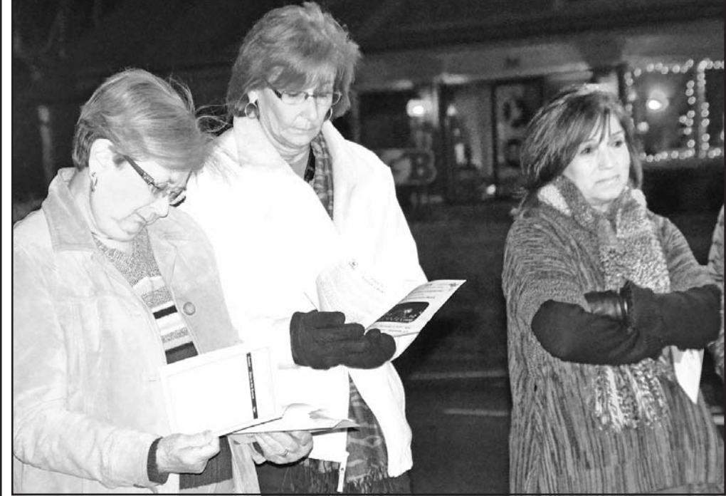
Those present for Friday's CASA luminaries learned about the dozens of children still in foster care in Union County.

nonprofit organization that spans across the Enotah Judicial Circuit – Union, Towns, White and Lumpkin counties – and helps more than 200 abused and neglected children in the foster system each year. Oftentimes these children are separated from their siblings and experience a great deal of confusion as they are processed through the system of social workers, foster homes and courts.